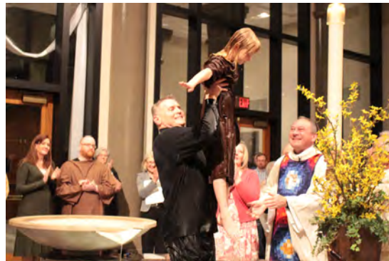
One of 12 baptized during Easter Vigil 2023.

A profession of faith isn't a sacrament but is the means by which a person who was baptized in another Christian church, whose baptism we recognize as valid, is received into the Catholic Church. The most common situation to celebrate this is for adults who were raised or became a part of another Christian church, but are now coming into the Catholic Church through the Rite of Christian Initiation of Adults (RCIA), and are received into the Catholic Church at the Easter Vigil on Holy Saturday. In this case, they would have been going through instructions on our faith throughout the previous year, and then immediately after making their profession of faith, they would be Confirmed and receive their First Communion, also at the Easter Vigil.