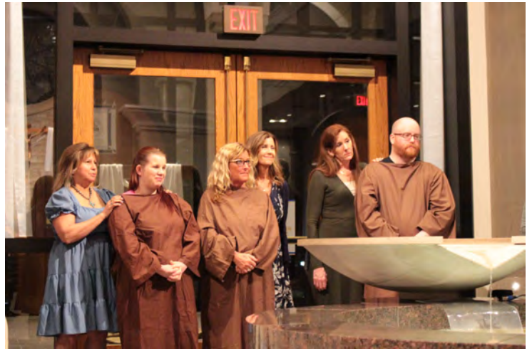
Those being baptized and their sponsors gather at the baptismal font.

For those coming into the Catholic Church that were not baptized, that is obvious, since they have not known Christ. For other Christians who have already been baptized but are not Catholic, we believe the fullness of Christ, the sacraments, and how Christ meant us to be united. Life is found in the Catholic Church; Christ is our head, and we are his body. We do not deny the relationship other Christians already have with Christ, that is why we believe in their baptisms and do not re-baptize people coming to the Catholic Church from other Christian denominations. But we do have a process to receive them into the Catholic Church, to be sure they understand what they are doing and are open to the obligations, the rights, and all the graces God offers us in the sacraments.