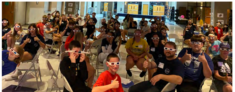
Middle schoolers at Assumption Edge enjoy exciting 3-D activities.

Edge, our middle school ministry, is offered in tandem with PSR and serves as dynamic faith formation in a youth ministry setting, preparing 7th and 8th grade youth to receive their Confirmation. All 7th grade and 8th grade youth are welcome, both Assumption school and public-school students. Students meet in grade-specific small groups that remain consistent throughout the year to facilitate holy friendships and trust, as well as mentoring relationships with adults and teen core members who lead the small group. Each Edge session is dynamic, prayerful, educational, and fun.