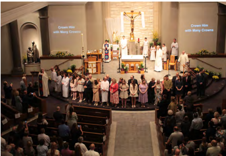
Those who have already been baptized in another Christian Church are being received into full communion with the Church.

You might hear us use the word evangelize at times, and we find it in these professions of faith. When we evangelize we have found the good news in Jesus Christ so we want to bring it to others so they may also have it and bring them to Him.