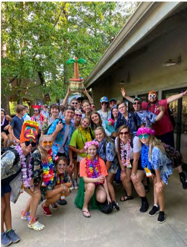
Assumption Life Teen fun at Camp Covecrest 2022.

Edge, our middle school ministry, is offered in tandem with PSR and serves as dynamic faith formation in a youth ministry setting, preparing 7th and 8th grade youth to receive their Confirmation. All 7th grade and 8th grade youth are welcome, both Assumption school and public-school students. Students meet in grade-specific small groups that remain consistent throughout the year to facilitate holy friendships and trust, as well as mentoring relationships with adults and teen core members who lead the small group. Each Edge session is dynamic, prayerful, educational, and fun.