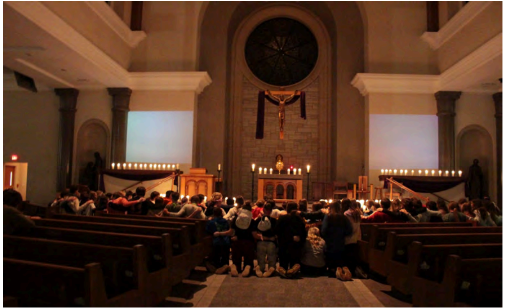
Eighth graders gather for Eucharistic Adoration during our annual Luke 18 Retreat.

Life Teen, our high school ministry, begins with the 5:30 p.m. Sunday Life Teen Mass, and then meets from 6:30 p.m. – 8:45 p.m., always starting with a meal, and then moving into session that breaks down our Catholic faith in a way that is vibrant, interactive, and leads to a deeper relationship with God and our parish community. We offer a weekend Fall Retreat at Marianist Retreat Center in Eureka, MO, as well as several summer retreat opportunities including the Life Teen Leadership Conference, Steubenville Youth Conference, and Life Teen Camp Covecrest. Teens are also an integral part of presenting our Luke 18 Confirmation Retreat to our 8th graders.