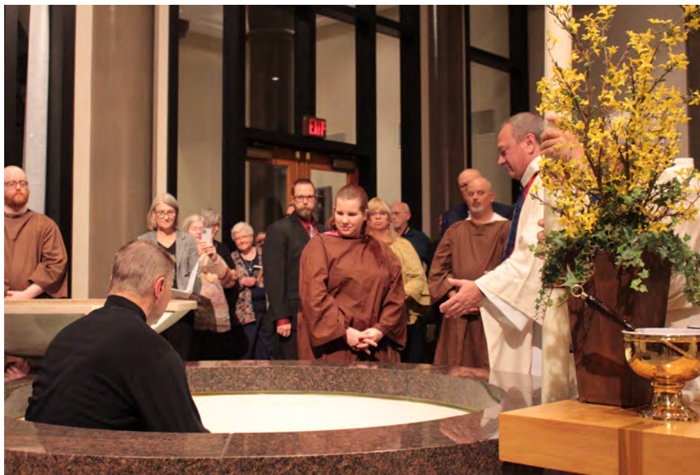
Candidates are welcomed into the baptismal font one at a time to be baptized.

One or both of the parents may already be Catholic, so the parents are not being received into the Church, but for some reason they were worshipping at another Christian Church when they had their child and had them baptized there. But now that their child has reached school age and may soon receive their First Reconciliation