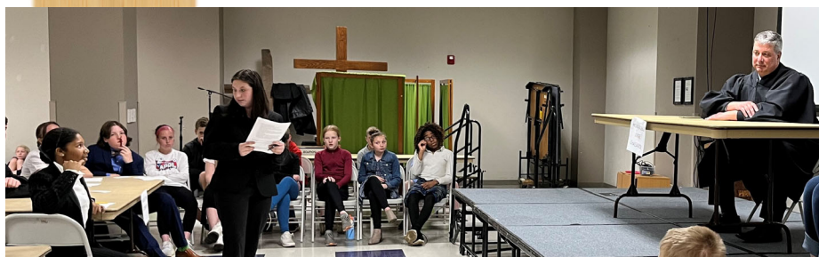
Judge, Lawyers, and Jurors