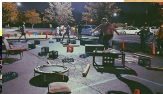
This was our Life Teen Kick Off.... "The Parking Lot is Lava Obstacle Course"! SO SO FUN!!!

3 – 5pm LT HQ Open Hours 5 – 6pm Holy Hour in the Chapel 6 – 8pm Summit Bible Study