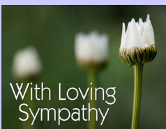
With Loving Sympathy

As part of our promise to protect and pledge to heal, the Archdiocese of St. Louis invites adult survivors of child sexual abuse to participate in a support group program to begin Wednesday, September 4. Sponsored by the Archdiocese, this expanded ministry will be offered at the Watson Road location of Saint Louis Counseling in Crestwood and is available to adult survivors at no cost. The closed groups will meet for six consecutive Wednesday evenings from 5:30pm until 7pm. Adult survivors of child sexual abuse may inquire by calling 314-544-3800. Registration is required and space is limited.