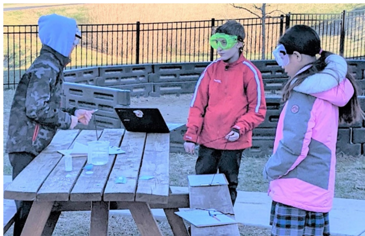
Mixing the ingredients, preparing for launch.

In speaking with the 5 th graders, their data showed that when the least amount of vinegar was used, it took a little longer to launch. They also learned that when there was less vinegar in the canister, there was more space for carbon dioxide gas and that takes time to build up enough pressure to pop the lid open.