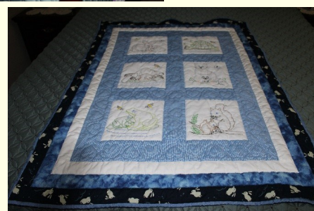
Baby Quilt: Wilderness Animals 6.5"x49"