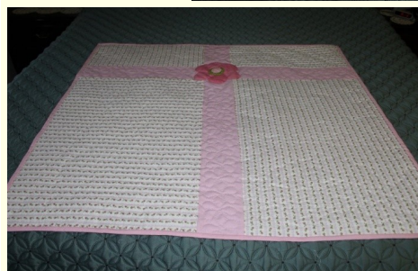
Baby Quilt: Pink Gift 39"x37.5"