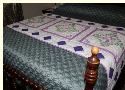
Bed Runner 34"x84"