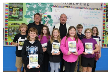
Bibles and textbooks for Assumption Parish School of Religion (PSR)