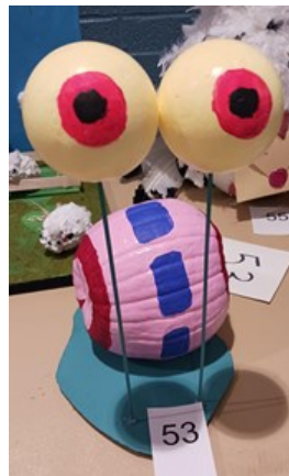
Snail with Large Eyes