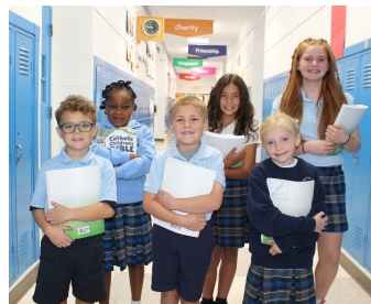
Assumption School Tuition Assistance