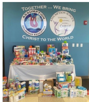
Donations could support the housing for our St. Vincent de Paul Society Food Pantry