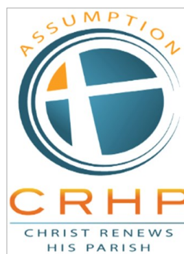
Christ Renews His Parish (CRHP) Retreats