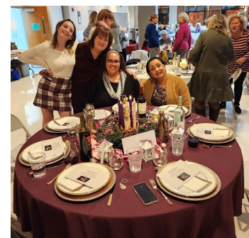
Supplies for the Assumption Parish Center