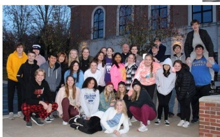
Life Teen and EDGE Retreats