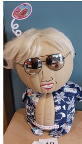
Pump-Ken (from Barbie movie)