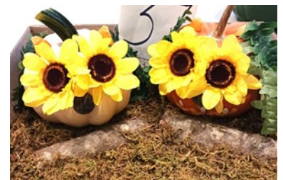
Owls with Daisy Eyes