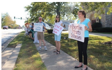
Respect Life Apostolate Pro-Life Ministry

Here are some ways your donations could support Assumption Parish.