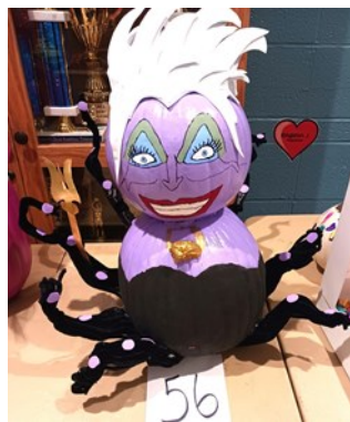
Ursula (from Little Mermaid)