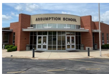
Assumption School Annual Fund the Need Campaign