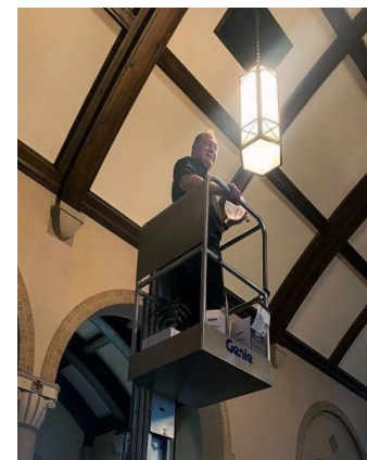
Parish and Chapel Lighting and HVAC Needs