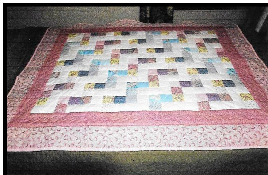
Baby Quilt 38" x 48"