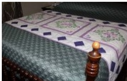
Bed Runner 34" x 84"

If you are interested in purchasing a quilt, please call Mary Pieper at 636-272-8292 and leave a message. Quilts can be purchased for cash or check only.