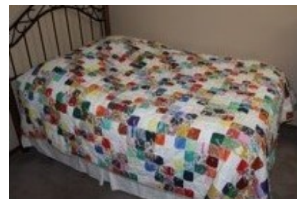
Full-Size Quilt 79" x 82"